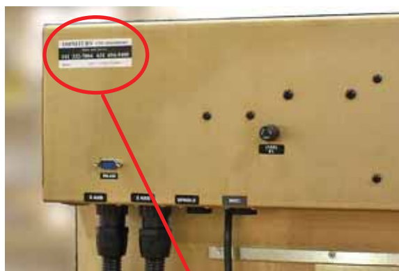
G3 CNC Serial Number