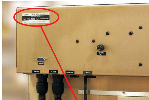
G3 CNC Serial Number