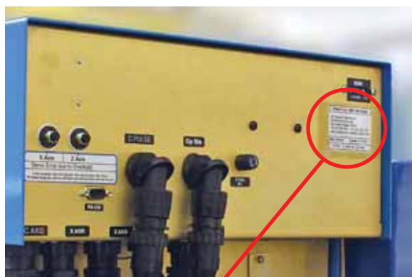
G4 CNC Serial Number