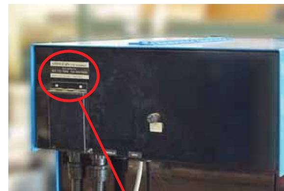
G2 CNC Serial Number