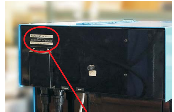
G2 CNC Serial Number