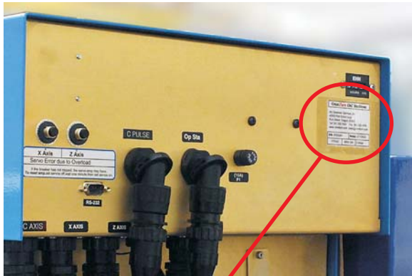
G4 CNC Serial Number