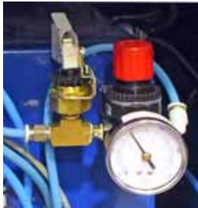
Collet Clamped Pressure switch installed on Collet Pressure regulator

collet_clamped_air_pressure_switch2.dcd AUG 2020